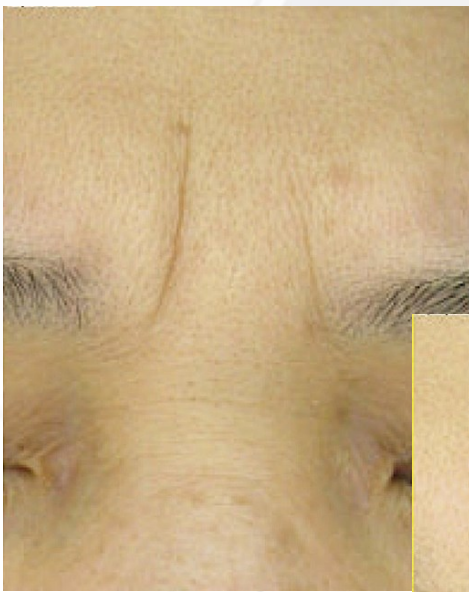
After 3 CytoPen ® / StemFacial ® treatments