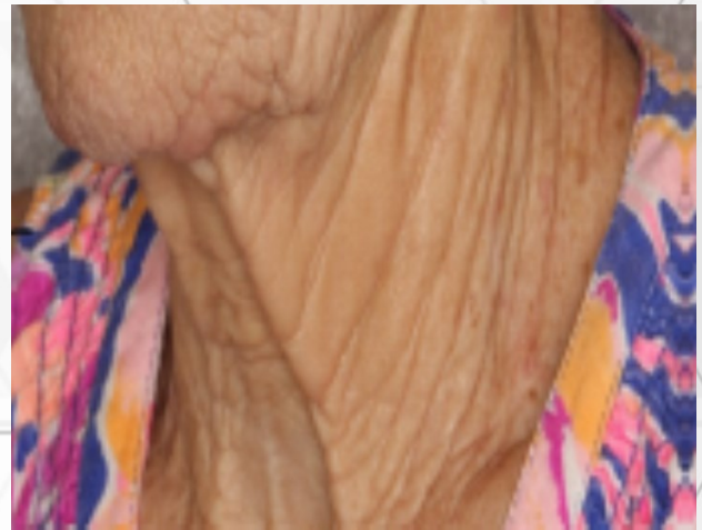
6 CytoPen ® / StemFacial ® treatments