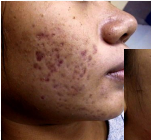
3 CytoPen ® / StemFacial ® treatments